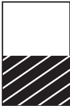
Half page horizontal