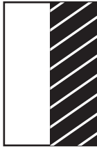
Half page vertical