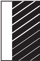
Two thirds page